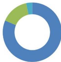
Operating Expenses 2017*