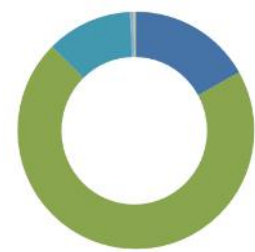
Select Assets as of 12/31/17*